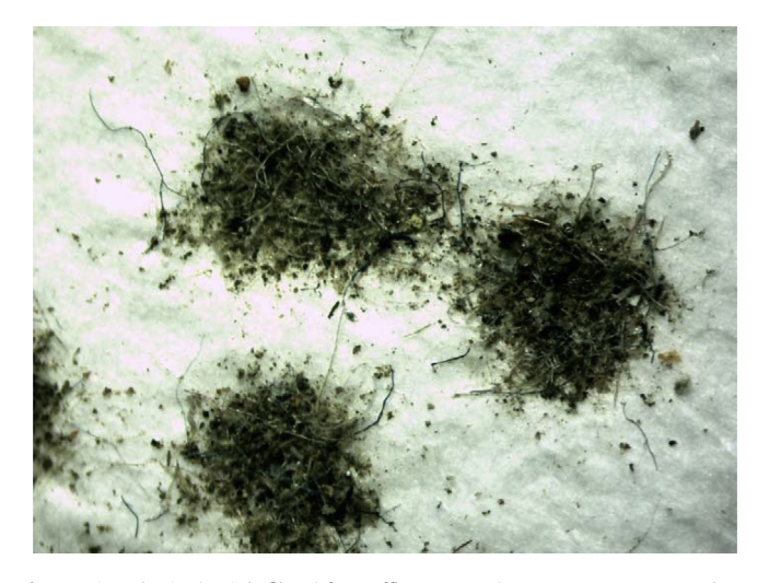
Fig. 2. Microplastics (mainly fibers) from effluent water (Wastewater Treatment Plant-Two Harbors, MN).

Spectroscopy is an excellent technique used to positively identify the synthetic polymers in a sample. Attenuated Total Reflectance with micro-Fourier Transform Infrared (ATR-µFT-IR)